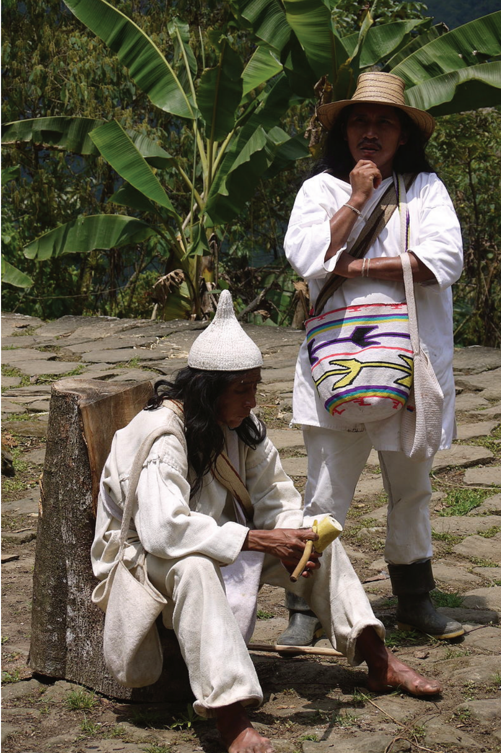
Koguis shaman in Columbia.

strong belief in faith based and alternative healing practices lead the usage of religious organizations for help in mental disorders. For example, recent Latina immigrants reported using alternative or complementary medicine first, and then sought medical help only if these methods were ineffective (Garces, Scarinci, & Harrison, 2006).