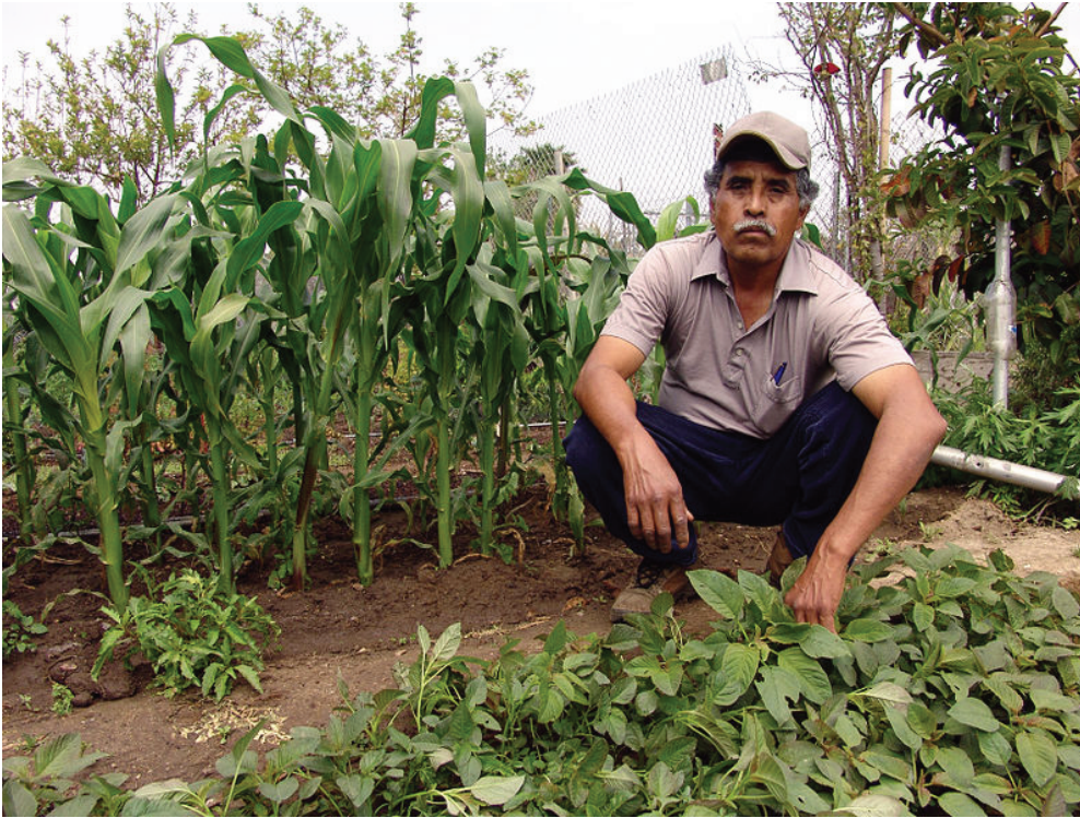
South Central Farm in Los Angeles, one of the largest urban gardens in the United States.