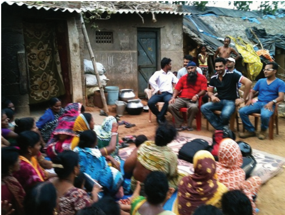
An Alcoholics Anonymous group.

Another study illustrated how Alcoholics Anonymous (AA) was adapted to suit immigrants from Central America. Hoffman (1994) reported factors such as location of AA meetings, adapting treatment to fit subpopulations within the Latino/a community in Los Angeles and incorporating the traditional 12 steps with group-specific values. The location of these AA meetings was crucial in getting young Latino/a males involved in the programs. Some meetings were held in churches, others in storefront buildings and others in more traditional rental spaces. These decisions were carefully made to ensure the groups’ abilities to reach their targeted populations. Some groups utilized a theme of Machismo in Terapia Dura (Rough Therapy) to remind members of the negative impact alcohol can have in their lives. Some elements of Terapia Dura include aggressiveness and competitiveness. Groups varied in their use of Machismo based on levels of acculturation and group values. Though such groups were not culturally sensitive to women’s and homosexual members’ needs, they provided a way to treat a specific group of people who have previously been shown to do poorly in traditional AA groups.