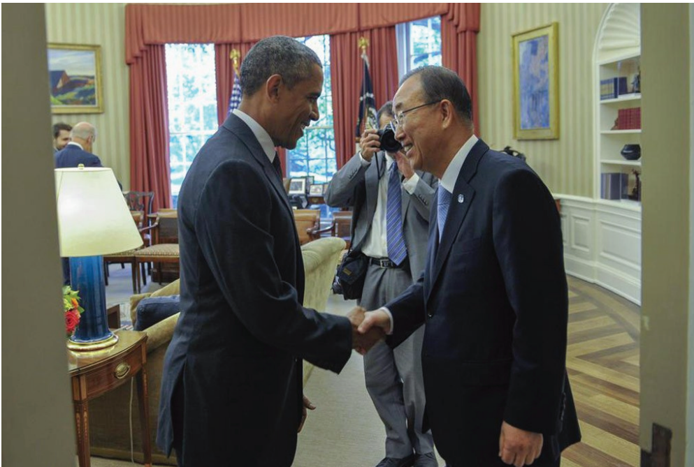
Secretary-General of the United Nations, Ban Ki-moon, meets President of the United States, Barack Obama.

The most pressing human rights issues in the United States revolve around immigrant and refugee families. The strategic priorities outlined by the UNHCR include: (a) countering discrimination; (b) combating impunity and strengthening accountability; (c) pursuing economic, social and cultural rights and combating poverty; (d) protecting human rights in the context of migration; (e) protecting human rights during armed conflict, violence and insecurity; and (f) strengthening international human rights mechanisms and the progressive development of international human rights law. Priorities (a), (c) and (d) make up the elements most germane to the human rights situation in the United States today. The difficulties faced by immigrant and refugee families include classism, racism, sexism, and discrimination on the basis of religion as well as uncertain economic circumstances.