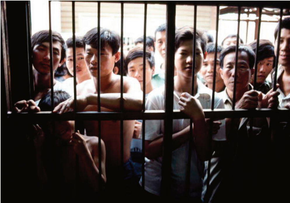
Refugees and displaced persons in South-East Asia; Cambodia, Vietnam, and Laos.