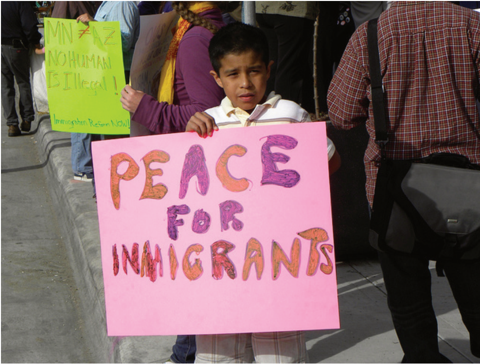
Minneapolis protest against Arizona immigrant law SB 1070.