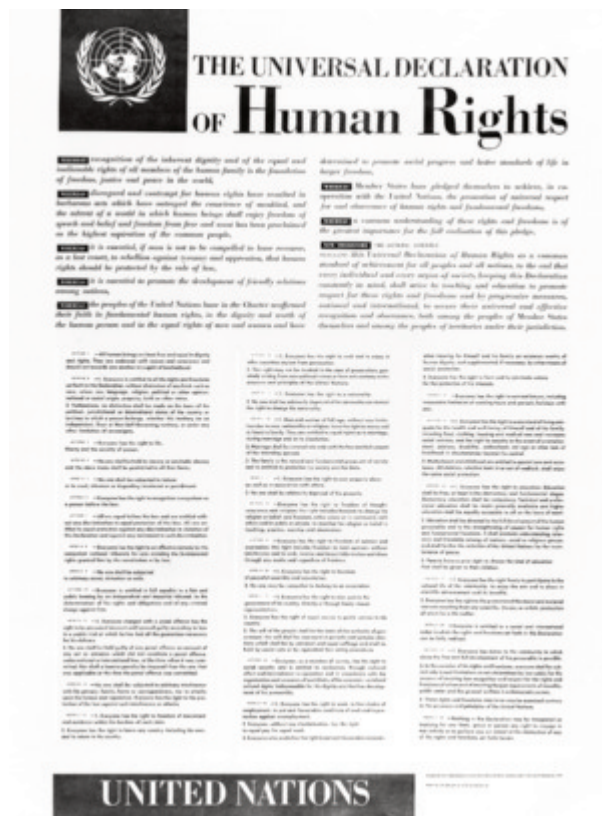
Poster depicting the Universal Declaration of Human Rights, English Version.

In response to the gross human rights violations following the Second World War, the UDHR was chartered by the United Nations in an attempt to prevent such atrocities from being committed again. The UDHR's preamble states unequivocally “recognition of the inherent dignity and of the equal and inalienable rights of all members of the human family is the foundation of freedom, justice and peace in the world” (OHCHR; Office of the High Commissioner for Human Rights, 1948). Following the preamble are 30 Articles, which lay out in detail the specific rights to which all human beings should be entitled. According to the UNHCR, there are 389 different translations of this document.