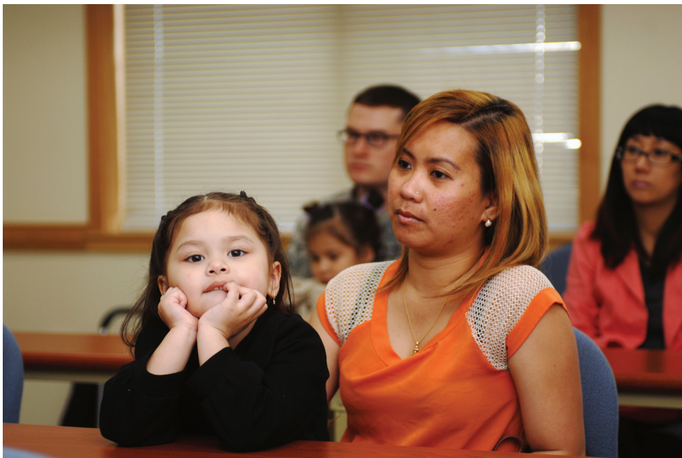
USCIS providing answers about citizenship and immigration for soldiers and families at Army Community Services in Seoul.

As we outlined in the policy section, United States policy prioritizes family reunification, and immigrant and refugees' spouses and children are eligible to immigrate without visa quotas. The majority of current immigrants are family members being reunited with United States citizens or permanent residents.