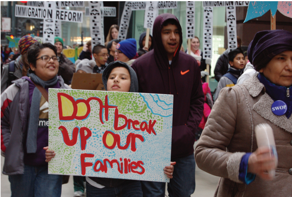
Protesting for immigration reform.