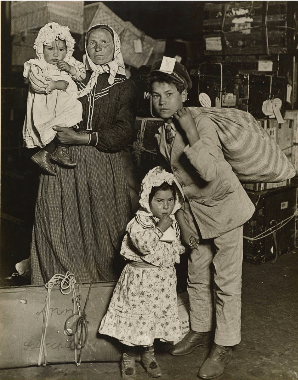
Immigrant Family in the Baggage Room of Ellis Island.