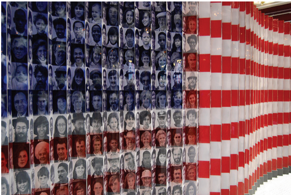
Ellis Island