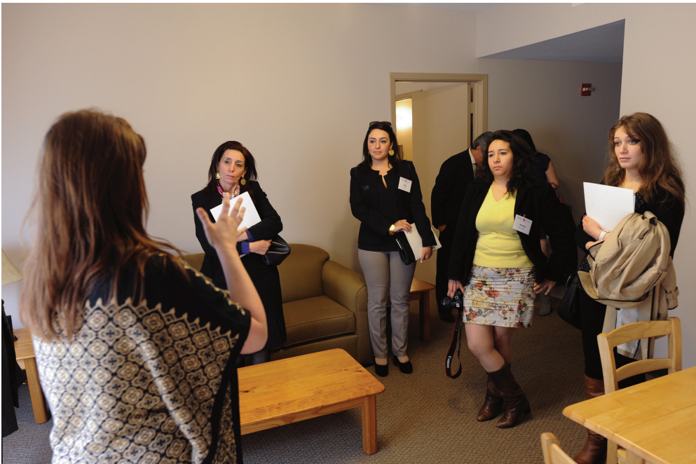
Fellows tour the Genesis Women's Shelter in Dallas, TX before meeting with a panel of local stakeholders.

Language barriers pose a critical problem for community-based organizations and for systems like the police, to communicate with the survivors and their families and to help them effectively (Yingling, et al., 2015; Robert Wood Johnson Foundation, 2009). Further, services, particularly culturally competent services, are not always available to immigrant/refugee women (Morash & Bui, 2008). Community-based organizations and mainstream service providers such as the police need to be trained to understand the complexities of survivors' lives and to assess common as well as the unique features of IPV experienced by immigrant/refugee women (Messing, Amanor-Boadu, Cavanaugh, Glass, & Campbell, 2013). Also, services providers for immigrant/refugee women must develop awareness about the socio-economic, cultural, and political contexts that these groups of women come from and use that information to develop programs and policies specific to them.