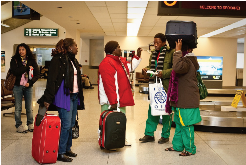
Congolese Family being met at the airport by their case worker.

The VOLAG works with sponsoring relatives when applicable, and will sometimes find an individual, church, or other private group that can assist with sponsorship if there is no sponsoring relative (Refugee Council USA, 2019). Refugees are eligible for all welfare benefits offered to citizens, such as Temporary Assistance for Needy Families and Medicaid.