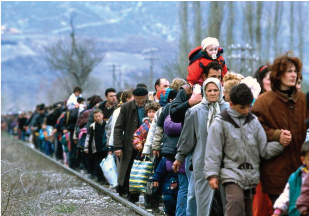
Kosovar refugees fleeing their homeland. [Blace area, The former Yugoslav Republic of Macedonia]

All refugees have experiences of loss and/or exposure to traumatic events, either personally or within their communities. Such experiences might include systematic discrimination and intimidation, civil war, ongoing military conflicts, forceful government expulsion from the country, ethnic cleansing, and even genocide. Families living in these contexts often experience violence, or they hear about it in their communities and have reason to fear it. Families' top priority is to find safety. However, even after they relocate, some families will experience the long-term effects from the traumatic stress they have experienced.