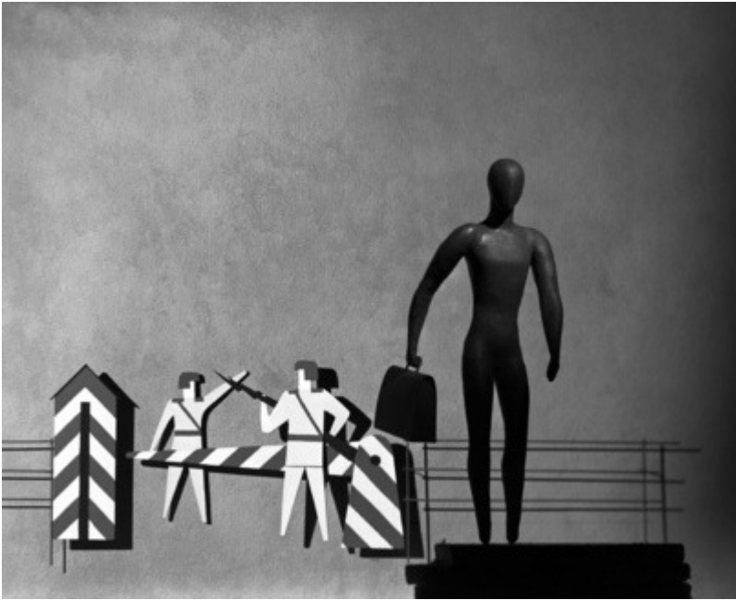
Poster entitled, "It is our

right to seek and enjoy in other countries asylum from persecution."