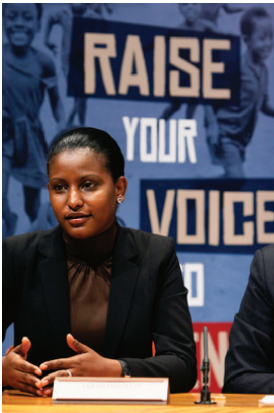
Angélique Kidio and Concer Sponsors Brief on Efforts to End FGM.

Female genital mutilation. Female genital mutilation (FGM), also known as female genital cutting, is a human rights issue of growing importance due to the increasing number of refugees arriving in the United States from East and West Africa. This practice, sometimes also known as female circumcision, is a long-standing cultural tradition in some communities. Although FGM is generally practiced in Muslim communities, there is no actual religious mandate for it (Cook, Dickens, & Fathalla, 2002). While the practice is deeply cultural, it is illegal in many African nations. However, regardless of legality, the practice is widespread. Fatima, for example, from the opening story, told the first author, “The president’s daughter has been circumcised – how will he enforce this law? Are they going to put him in jail? Hah!” (Personal communication, 2011).