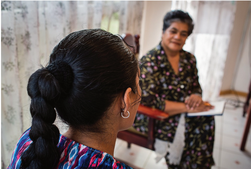
A counselor talks with a woman who was a victim of partner abuse.