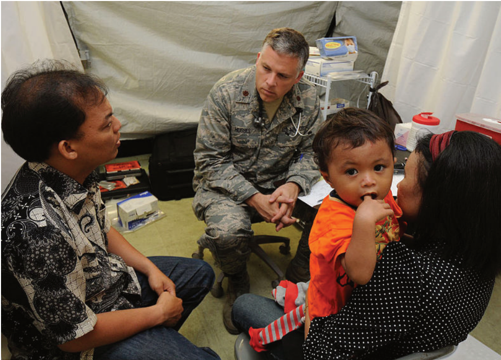
Air Force doctor provides services through an interpreter.