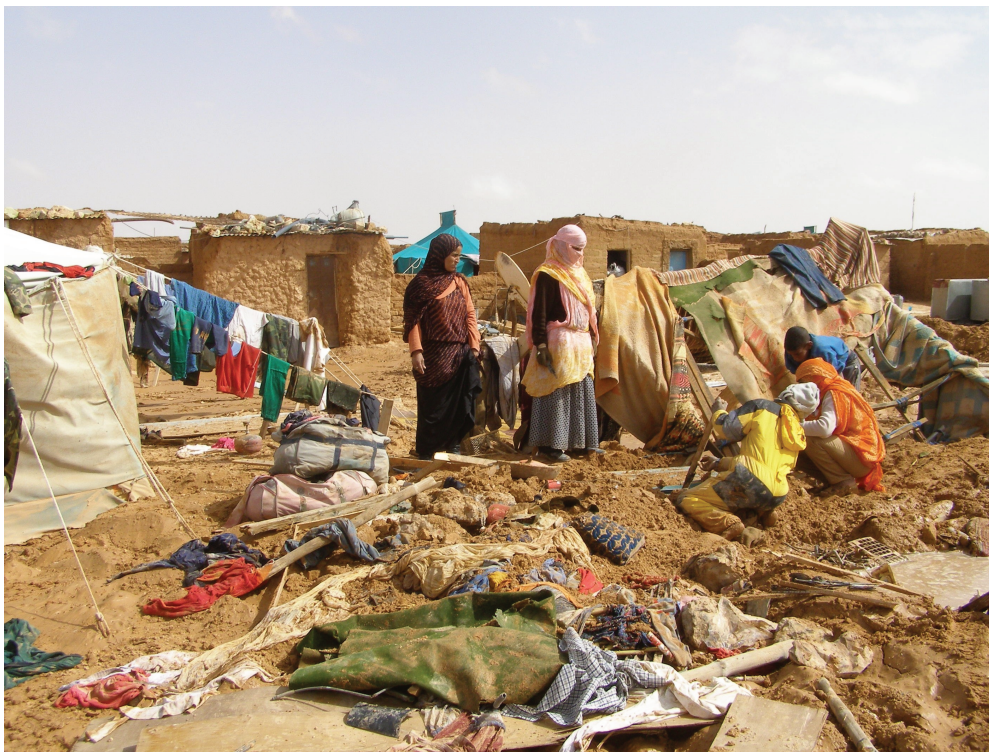
Floods in Sahrawi refugee camps in southwest Algeria.

Family consequences of exposure to traumatic stress include financial strain, abuse, neglect, poverty, chronic illness, and increased family stress (Weine et al., 2004), as well as a decreased ability to parent (Gewirtz, Forgatch, & Wieling, 2008). Individuals with PTSD, for example, are likely to be more reactive, more violent, and more withdrawn in relationships with a spouse or children (Gewirtz, Polusny, DeGarmo, Khaylis, & Erbes, 2010; Nickerson et al. 2011).