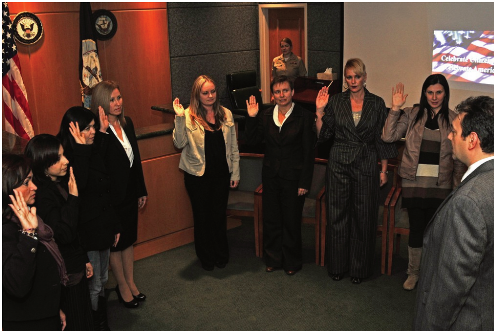
Spouses of United States service members in Italy take the oath of allegiance to become United States citizens.