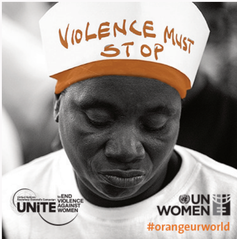
The UN has a campaign to end violence against women across the globe. For 2 weeks in 2013, activists and celebrities wore orange to raise awareness of violence against women.