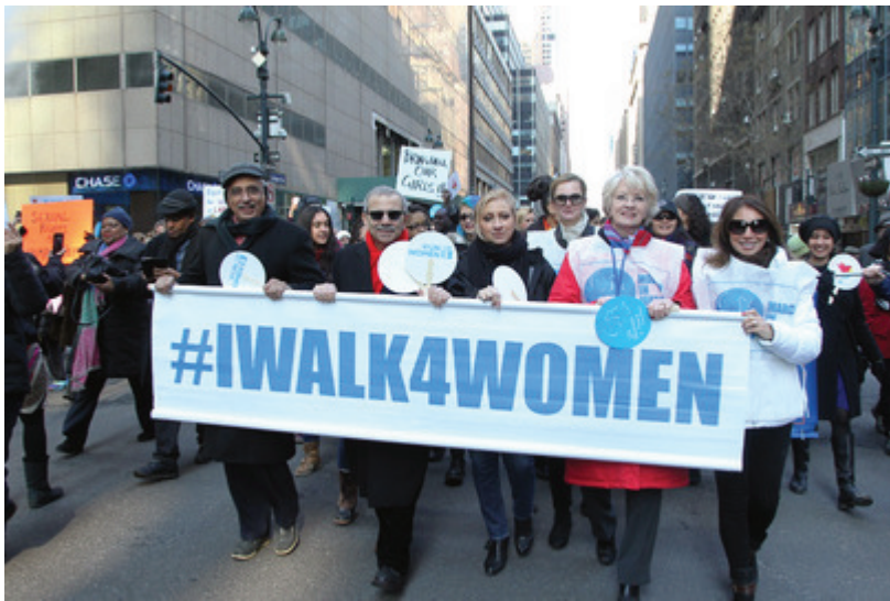
International Women’s Day March for Gender Equality and Women’s Rights.

The UNHCR has, within the last decade, specifically recognized gender as a fundamental human rights issue. The policy on refugee women is based on the recognition that becoming a refugee affects men and women differently: “... even where there is no armed conflict, women and children continue to be subject to serious human rights violations resulting from discrimination and/or violence against them due to their gender...” (Zeiss Stange, Oyster, & Sloan, 2012). Many of the human rights issues that involve women and children obviously impact families in a very deep way. This category of violation stems from historical perceptions of women and children as property or “chattel.”