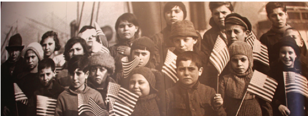
Picture this! Immigrant Children (at Ellis Island)