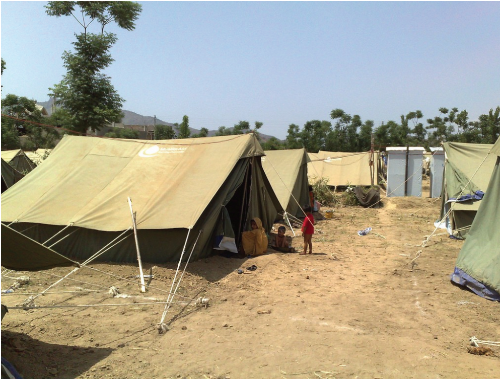
Figure 1. Camp for Pakistani Refugees.