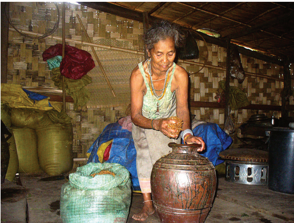
Brao woman making rice wine in a jar

Norms in country of origin and acculturation to local customs. The norms from the country of origin frequently play a role in an immigrant's substance use and abuse after arrival. For example, in a study of Asian American immigrants, the detrimental drinking pattern (or the “extent to which frequent heavy drinking, drunkenness, festive drinking at community celebrations, drinking with meals, and drinking in public places are common”) in the country of origin was significantly associated with the risk of frequent drunkenness and alcohol-abuse symptoms (Cook, Bond, Karriker-Jaffe, & Zemore, 2013, p. 533). Drinking prevalence (or the “extent to which alcohol consumption is integrated into society as an ordinary occurrence”) in the country of origin was associated with alcohol dependence symptoms (Cook et al., 2013, p. 533). Acculturation to the United States consumption behaviors can also increase the risk of substance abuse (Ezard, 2012; Bacio, Mays, & Lau, 2012; Kam, 2011; Prado et al., 2009). Pumariiega, Millsaps, Rodriguez, Moser, & Pumariiega (2007), for example, found that adolescents may be at an increased risk of substance abuse due to the challenges of acculturation and adopting ‘Americanized’ activities.