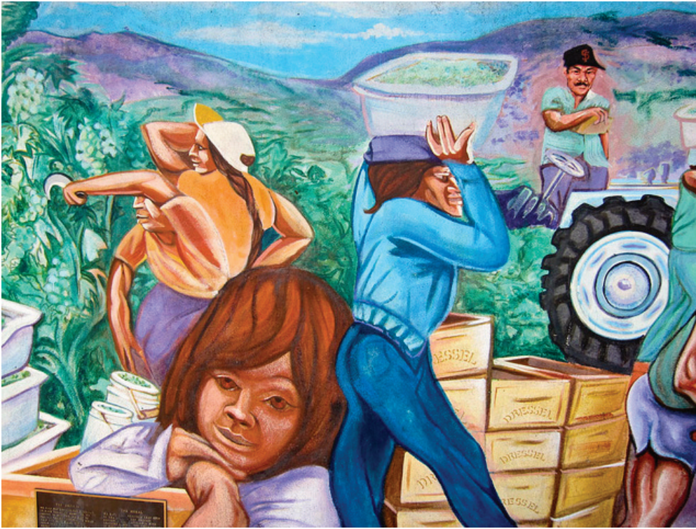
Mural to honor migrant workers at the Gundlach-Bundschu winery.

Chris deRham – honoring the vineyard workers – CC BY-NC-ND 2.0.