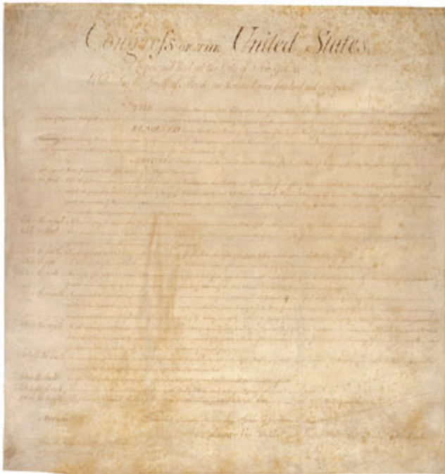
Original Bill of Rights, United States.

The Bill of Rights, as codified in the United States Constitution, lays out specific human rights that parallel those to which the majority of international human rights regimes adhere. Thus, the founding myths of this country are grounded in the central place of human rights (Donnelly, 2003). In fact, many if not most liberal democracies share these constitutive principles. As Koopmans (2012) points out, “internal constitutive principles – such as the right to exercise one’s religion... imply that the granting of rights to individuals and groups will be more similar across democracies than it will be between them and non-democracies” (p 25). And yet, there remain significant areas where United States domestic policy can be seen to violate various rights of various portions of the population at any given time.