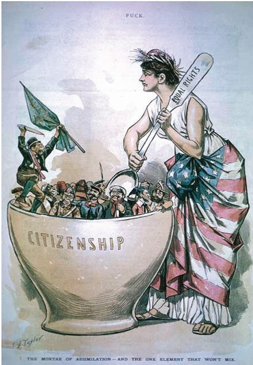
The Mortar of Assimilation and the One Element that Won't Mix

Cartoon from PUCK June 26, 1889 – public domain.