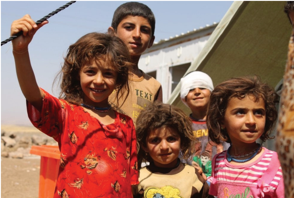
Iraqi refugee children preparing for relocation.