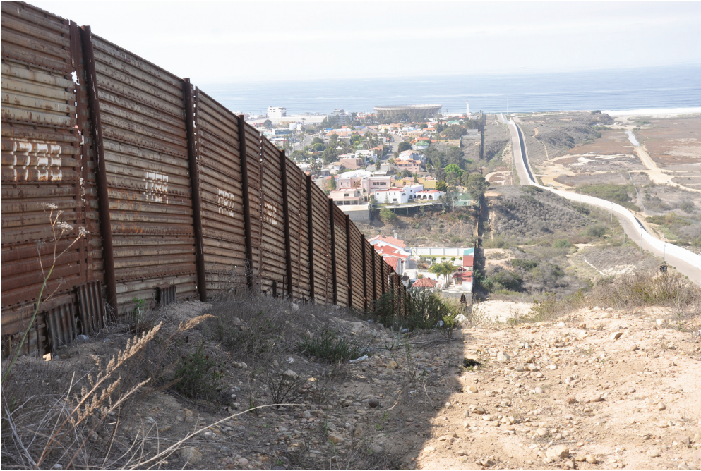
BBC World Service – Border fence – CC BY-NC 2.0.