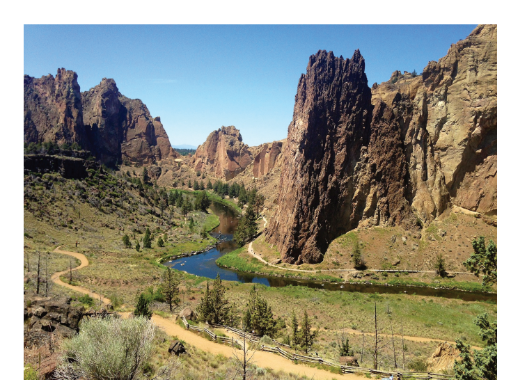
Smith Rock in the afternoon

Do you like rock climbing? Smith Rock is in the high desert of Central Oregon. It is a very popular park. People like to climb its rocky cliffs and towers. It has 623 acres, and there are many animals, such as eagles, mountain lions, and deer.