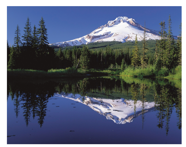
Mt. Hood Reflected in Mirror Lake

Mount Hood is a famous place to visit in Oregon. You can see the mountain from many places in the state. It is about 50 miles from Portland. You can drive from the city to the mountain in about one hour.