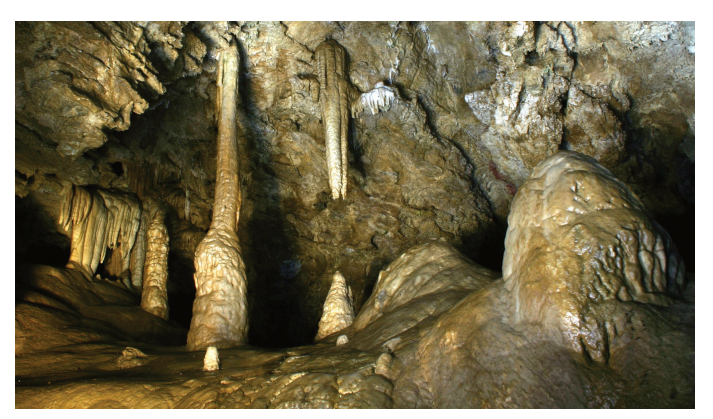
Orca Millers Chapel

Many people like to climb to the tops of mountains in Oregon. However, some people like to go inside a mountain. They like to explore the Oregon Caves.