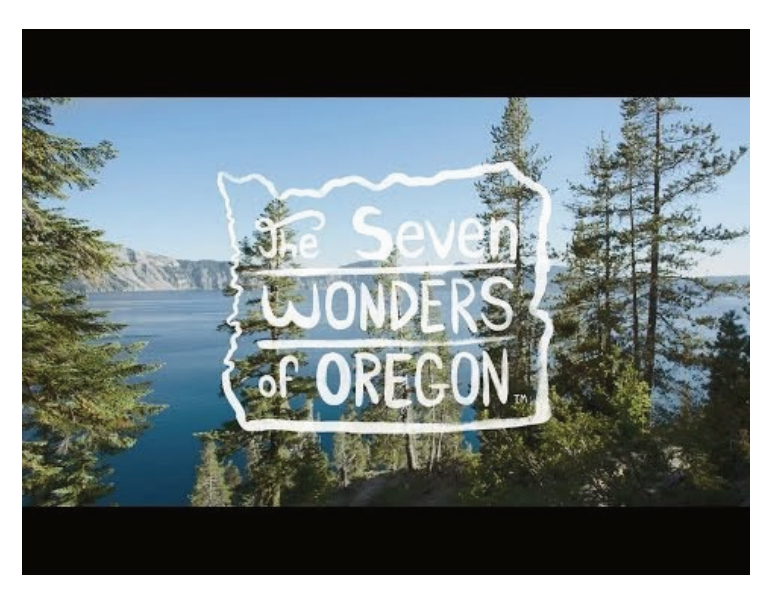
A YouTube element has been excluded from this version of the text. You can view it online here: https://openoregon.pressbooks.pub/ sevenwondersoforegon/?p=81

Oregon has many beautiful places. There are tall mountains, small hills, and unusual caves. There are green forests and brown deserts. There is the Pacific Ocean. There are also lakes, rivers, waterfalls, and much more!