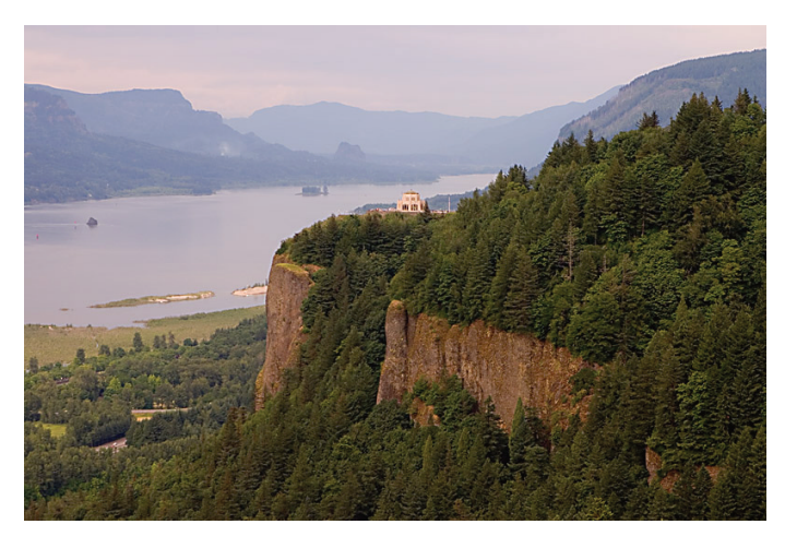
Columbia River Gorge

The Columbia River Gorge separates the states of Oregon and Washington. The word gorge is another name for a canyon. It is a deep valley between hills or mountains. A gorge usually has high walls and a river running through it.