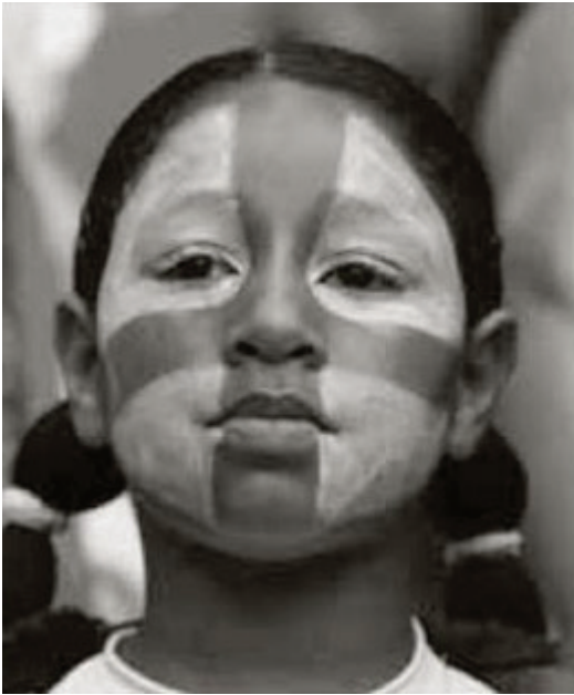
Figure 2 An expression of the English nation: a young football fan watches England v. Iceland