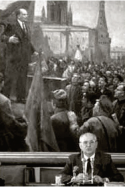
Figure 1 The end of the Soviet Union: Mikhail Gorbachev at a press conference, Moscow, July 1991