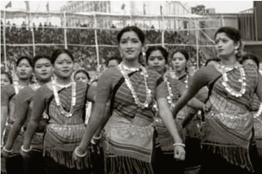
Figure 5 Celebration of a nation: Bangladeshi women parade at a ceremony celebrating the thirtieth anniversary of the declaration of independence from Pakistan, March 2001