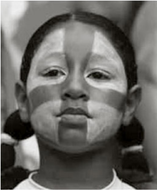
Figure 2 An expression of the English nation: a young football fan watches England v. Iceland