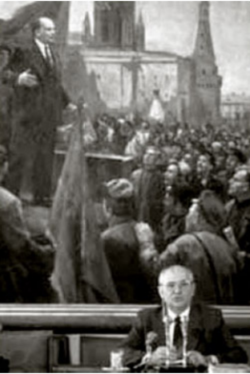
Figure 1 The end of the Soviet Union: Mikhail Gorbachev at a press conference, Moscow, July 1991