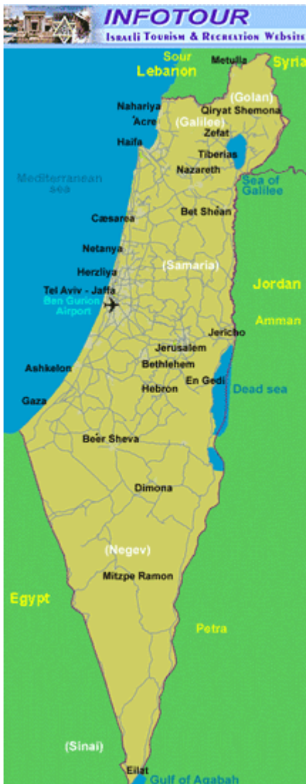
Figure 3 Visual images of a nation: website displaying map for Israeli tourism Long description