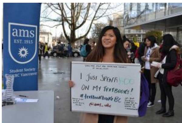
Image from UBC AMS #textbookbrokeBC campaign. See more at http://wiki.ubc.ca/Category:Open_AMS

This campaign involves asking students to take a photo showing how much they spent on their textbooks, then posting the photo on social media along with the hashtag #textbookbroke (or a variation of this hashtag, like #textbookbrokeBC). The photo could be taken as the student leaves their campus bookstore, or an image of their bookstore receipt could be posted online along with the hashtag.