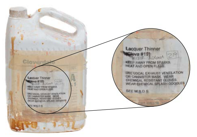
Figure 2 — Workplace label

Figure 2 shows an example of a workplace label.