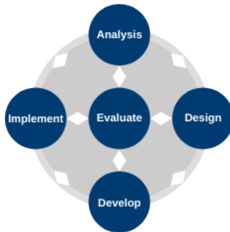
Figure 1. ADDIE as a Cyclical Process

The guidelines below outline some practical ways to use the ADDIE model to guide you towards creating your learning module.