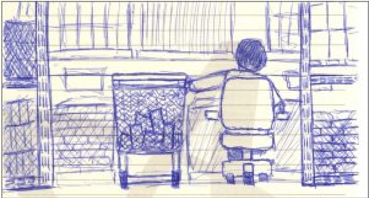
Figure 2. Reflective journal entry drawing

[Excerpt from student H's reflective journal entry. Permission to use this excerpt has been received from my former student, who requested that this pseudonym be used.]