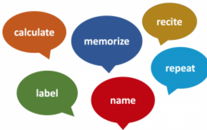
Figure 2. Terminology often used at the Ideas phase of learning. See Appendix for an expanded list

Connections are of two kinds – content-related Connections and those that involve personal meaning-making on the part of the student. In our history example, a Connection might be that students are able to articulate cause and effect relationships between historical events or perhaps begin to understand their own family’s emigration patterns in relation to world events. In math, students might be able to select appropriate equations relative to the characteristics of a problem. And in basketball, players would be able to combine two discrete skills, like running and dribbling, into a successful, more complex function. We’re hoping that, as you’re reading this, you’re thinking of your own instructional context, discerning the types of learning you’re expecting from your students, or undertaking yourself. In doing that, you’d be seeking to make Connections of your own, to what we’re presenting, through the process of meaning-making.