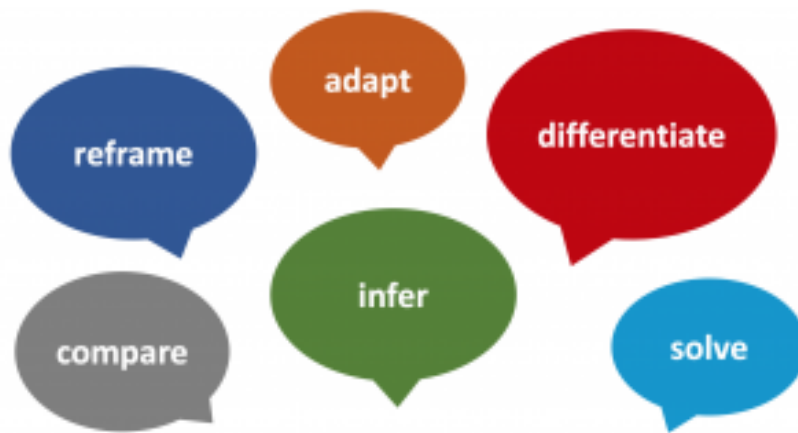
Figure 3. Terminology often used at the Connections phase of learning. See Appendix for an expanded list.

Extensions occur when students are able to appreciate the implications of their learning or develop the ability to use their learning in an entirely new context beyond the original learning environment. Using our history example, that might mean that students develop the capacity to interpret current events through new perspectives in ways that enable them to anticipate the evolution of global events. In math, the ability to make Extensions might enable students to create an equation as an expression of an unfamiliar problem. An Extension in basketball may be that a player becomes able to interpret play to the extent that they can pass to a spot on the court in anticipation of their teammate's position.