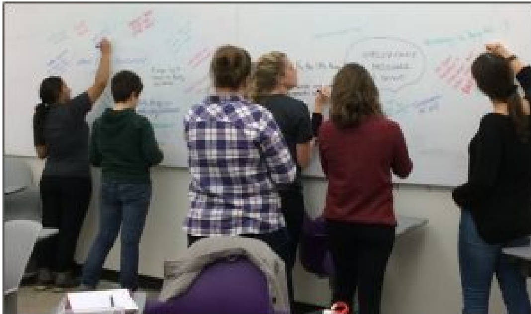
Figure 1: Students answer the question, "So what?"

The last tutorial of the course culminated in a whiteboard collaborative exercise to gather students' collective lessons learned in response to the question "So What?". Numerous themes were identified and shared, resulting in the construction of a visual representation which was often included in the students' journals as a cue for concluding comments. (See photo and text box below)