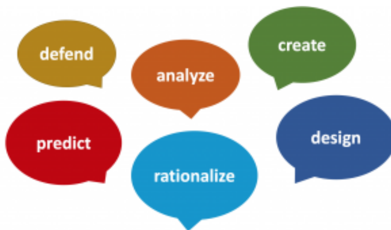
Figure 4. Terminology often used at the Extensions stage of learning. See Appendix for an expanded list.

Extensions occur when students are able to appreciate the implications of their learning or develop the ability to use their learning in an entirely new context beyond the original learning environment. Using our history example, that might mean that students develop the capacity to interpret current events through new perspectives in ways that enable them to anticipate the evolution of global events. In math, the ability to make Extensions might enable students to create an equation as an expression of an unfamiliar problem. An Extension in basketball may be that a player becomes able to interpret play to the extent that they can pass to a spot on the court in anticipation of their teammate's position.